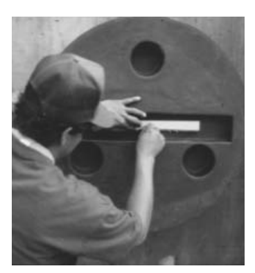
6. Guide the 1" wood block over the threaded rod and secure the assembly with the wing nut provided.