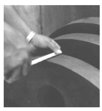
5. Additional disks are interlocked to accommodate finished wall thickness. Verify thickness is the same as wall.