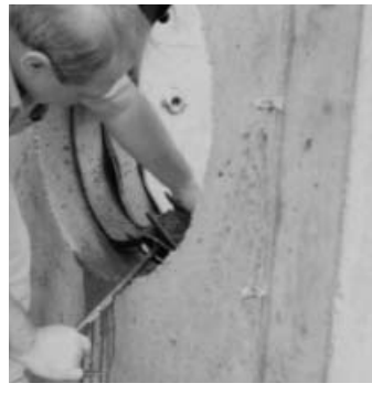
10. Remove disks by breaking out the entire assembly.