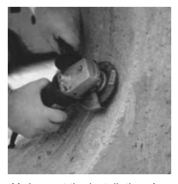
11. Inspect the installation. A smooth opening is important for a proper Link-Seal® modular seal installation. Repair voids and grind smooth any ridges.

If you should have questions using the techniques provided, Call mdg at 610-935-9500. Note: For walls greater than 16", please contact mdg. *Note: Threaded rod must be requested when ordered. Make sure TRA is added to the end of the ordering code.