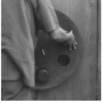
3. Slide the first Cell-Cast® disk over the *threaded rod. Note: Use only 1 threaded rod for equal distribution. More than one rod could take disks out of shape.