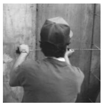
1. Locate center line where the hole is desired. This location will be used as a guide for the threaded centering assist rod.