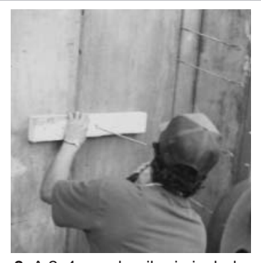
2. A 2x4 wood nailer is included. Fasten it along with the threaded rod directly to the concrete form. This provides support and helps center the complete Cell-Cast® disk assembly.