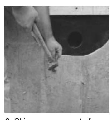
9. Chip excess concrete from the edge of the Cell-Cast® disk assembly and wall.