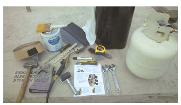
Tools Required for Installation

Note: Detailed/Complete Installation Guidelines packaged with boxed Riser-Wrap® material.