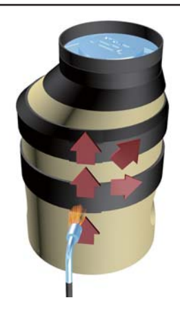
6. Using a moderate to high flame, begin heating Riser-Wrap® sleeve material from the bottom edge moving around the structure in one direction.