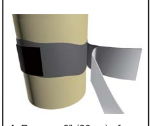
4. Remove 8" (20cm) of release backing and position exposed surface on cleaned and primered seam area. Expose 8" (20cm) sections at a time as you wrap the sleeve material around the entire circumference of the manhole.