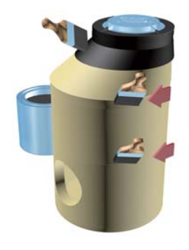
3. Apply Polyken #1027 or #1039 liquid adhesive primers to the entire exposed concrete application surface.